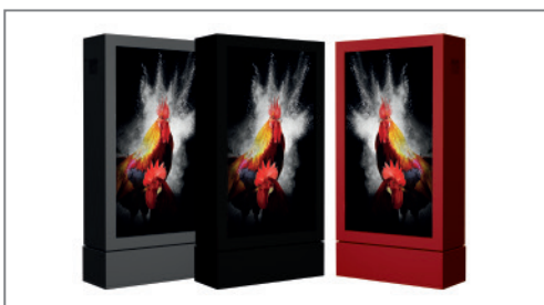
Optional individual colour design possible