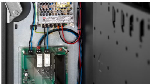
Cabling according to VDE guidelines

Optionally, the totem can be customized in special RAL colours or with a logo.